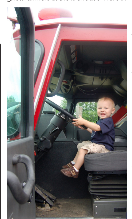
from Tonka! Complete with all buttons! "So realistic!"