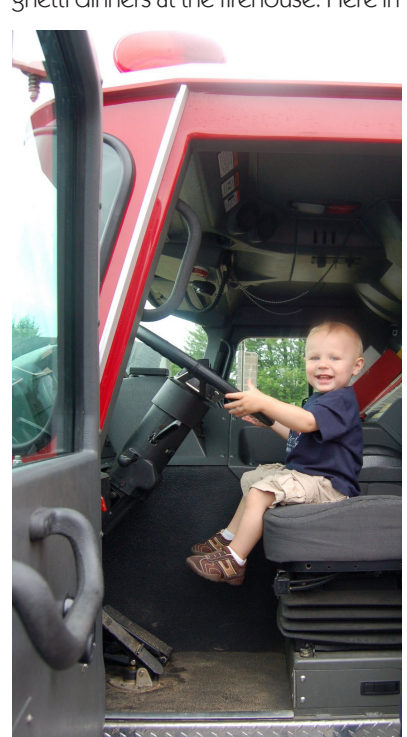
Coming to stores this Christmas, the newest truck

One of the first things I noticed when In small towns, you generally only saw Ridiculous! I got to 'town' was an almost constant fire trucks at three key times in the year: parades, school career days, and spaghetti dinners at the firehouse. Here in