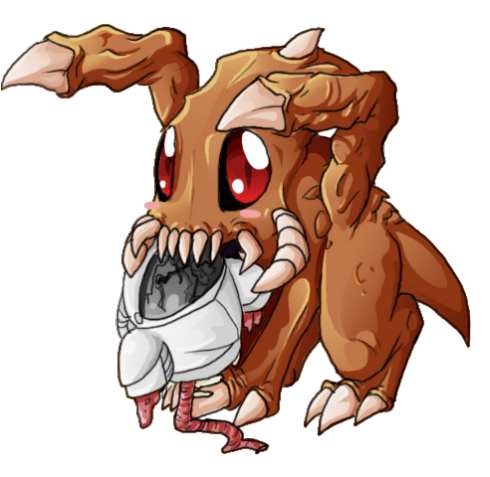
This is the enemy, soldier. It is cute. It is adorable, and you may even want to hug it, but it will kill YOU. Cutely.

Beware these newcomers. for they only have enough knowledge to be dangerous, but not enough to be useful. And yet, perhaps it falls upon us, the stronger years, the wiser ones, to teach them - for as every one of us was told during our Saturday morning cartoons, the power is ours. As my friend Government Issue Joseph once said, "Knowing is half the battle." Perhaps he is correct, and in order to fend off the coming onslaught of newbies, we should educate rather then eliminate.